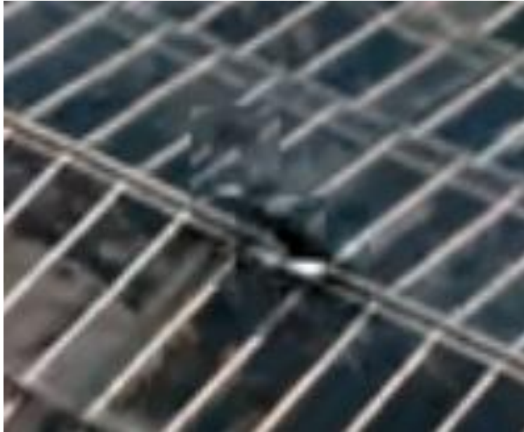
Digital trick (detail)