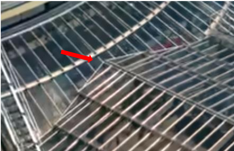
No way out at the end of the canopy